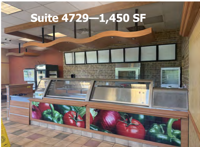
Suite 4729—1,450 SF