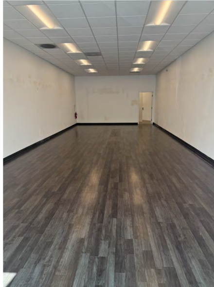
Suite 4725—1,040 SF