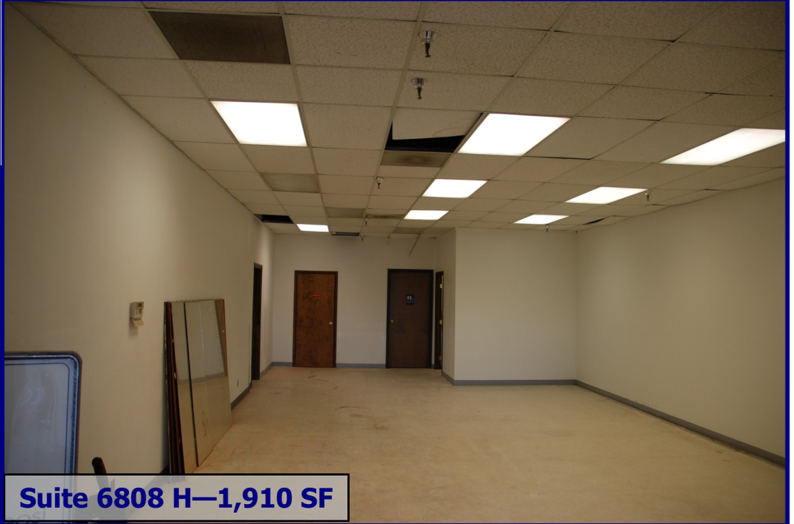
Suite 6808 H—1,910 SF