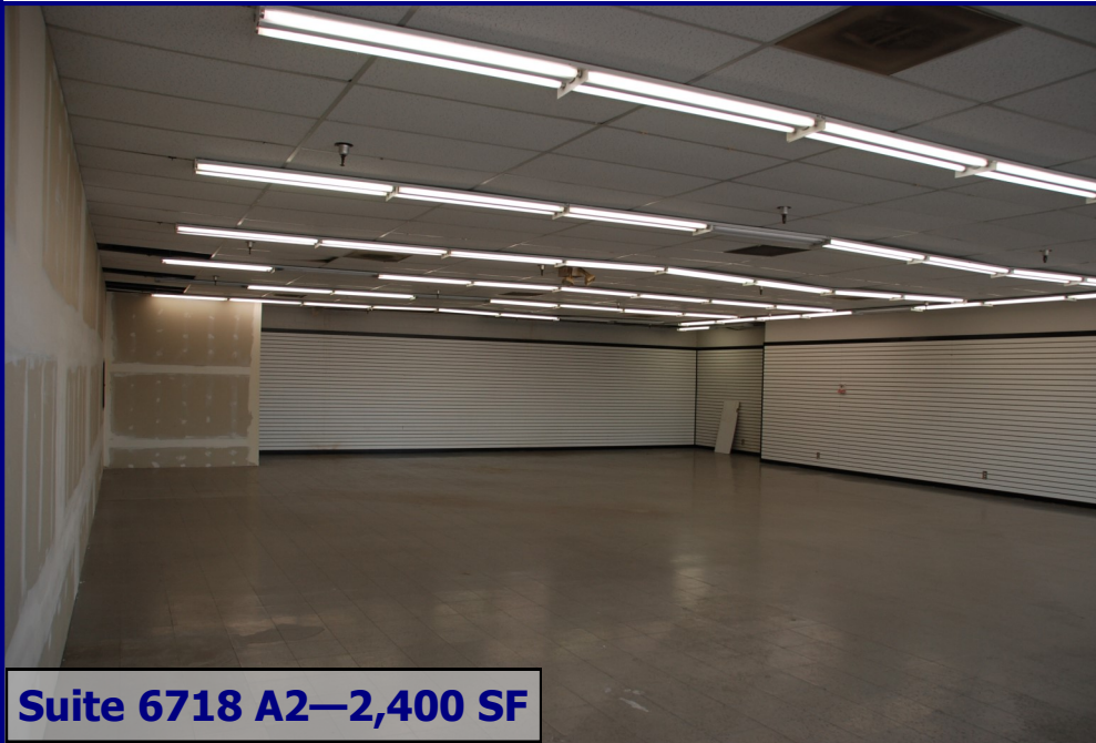
Suite 6718 A2—2,400 SF