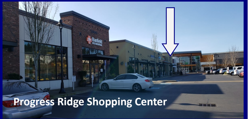
Progress Ridge Shopping Center