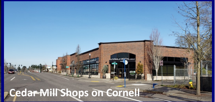
Cedar Mill Shops on Cornell