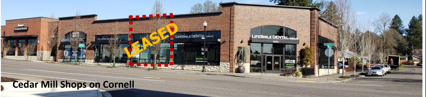
Cedar Mill Shops on Cornell