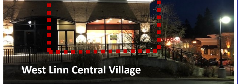
West Linn Central Village