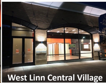
West Linn Central Village