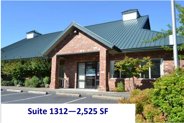
Suite 1312—2,525 SF

1312-1360 E Powell Blvd, Gresham OR 97030